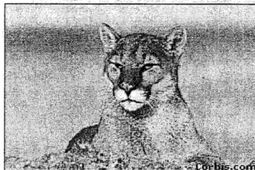
Mountain Lion/Cougar Felis concolor

Lilacs bulldozed, crushed under Lilac Country Lane Stream trickles with pesticides Hidden Creek Golf Course Eagle's riparian land parceled Eagle's Nest Estates Six thousand oaks destroyed Oakwood Community Deer haven't roamed in 20 years Deer Lake Homes Chumash diseased and scattered Indian Oaks Condos All that remains is sky Mountain View Park