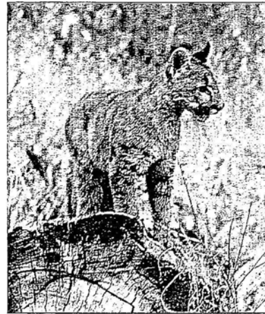
Mountain lion kittens, or cubs, have blackish-brown spots, dark rings around their tails, and pale blue eyes.